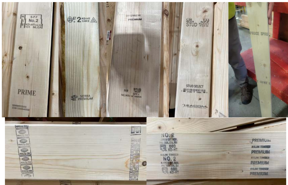
Figure 3 – Shows several examples that illustrate use of ALSC grade terms “Prime”, “Premium”, “Select”, or species on lumber even though these terms may not be in the particular agency’s rule book.

ALSC staff response: ALSC staff will object if there is wording or symbols that reflect the species, grade name, moisture content, or phytosanitary treatment on a product (the “Product Marking”) that is included in the book of the rules-writing agency under