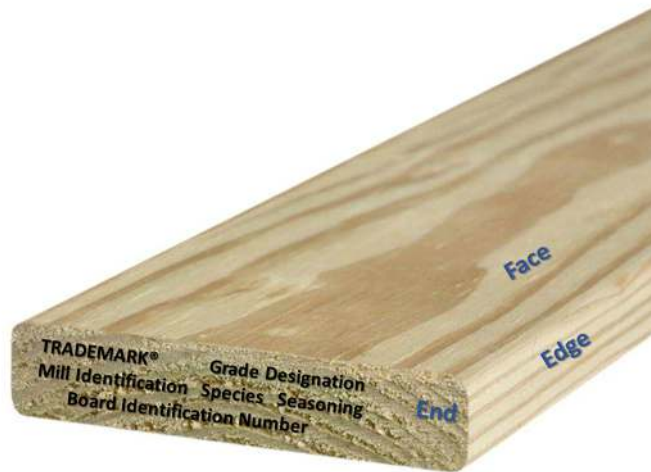
Illustration of End labeling of lumber