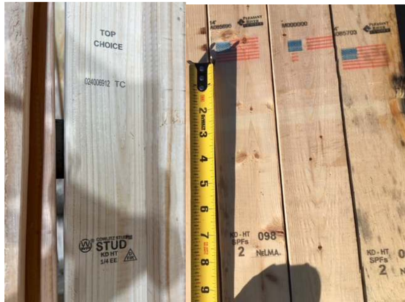
Figure 2 — Labels using terms that are clearly non-ALSC terms like “Top Choice” and a reproduction of the American flag.