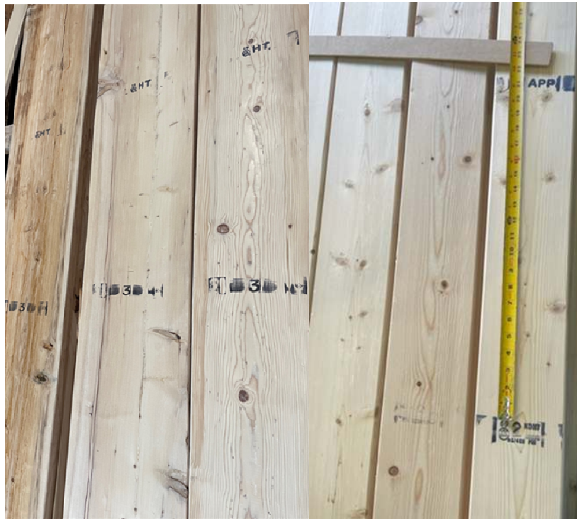
Figure 1 — shows examples of marking grade nomenclature in the applicable accredited agency's rule book even though the boards are not being graded according to the grade designation. The stamped information 3 and APP label are present on lumber when not being graded according to 3 or APP rule.

Situation: A request has been made to further clarify what information included on ALSC-stamped products by an ALSC accredited agencies subscriber would be considered a confusing or deceptive marking. Note that in general products are permitted to be stamped with marketing and other language provided that such other information is at least six inches from the grade-stamp and such other information is not confusingly or deceptively similar to the grademarks of an ALSC-accredited agency. ALSC staff has observed several examples of labels located greater than 6 inches from the grade stamp which may be considered confusingly or deceptively similar to ALSC-accredited agency grademarks (Figures 1-3).